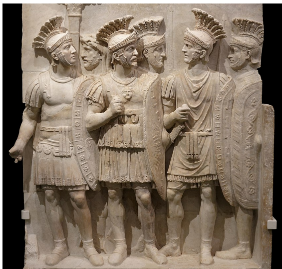
Praetorians Relief, from Rome, circa AD 51–52

PAUL LED MANY OF THE PRAETORIAN GUARDS WHO GUARDED HIM TO CHRIST.