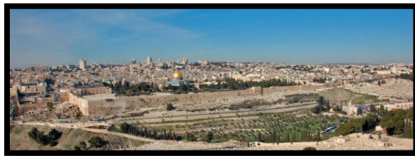
Figures 2 and 3: Jerusalem today. Figure 2 shows Jerusalem as viewed from Mount Scopus with the Temple Mount in the center and the Old City to the right. Figure 3 shows Jerusalem as viewed from the Mount of Olives with the Temple Mount in the foreground, the Old City in the background, and the New City in the far background.